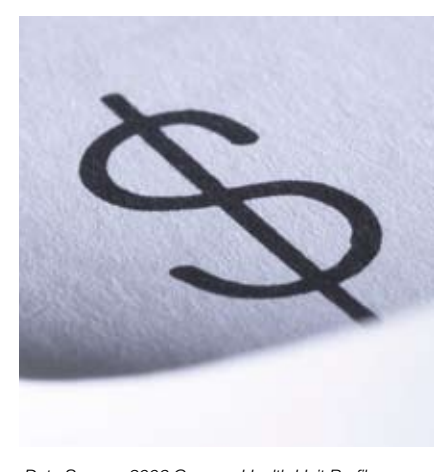
Data Source: 2006 Census, Health Unit Profiles. Statistics Canada Website: http://www12.statcan.ca.

Data Notes: Low-Income Cut-Offs are based on the cost of living, family size, and place of residence (urban or rural).