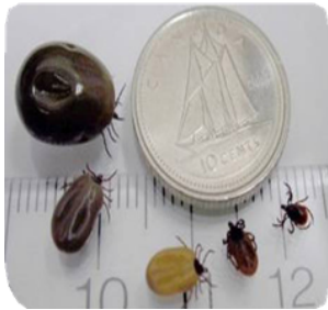
Adult ticks become bigger as they feed and can grow from the size of a sesame seed to as large as a grape.